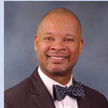
Senate Majority Leader Aaron D. Ford (D)