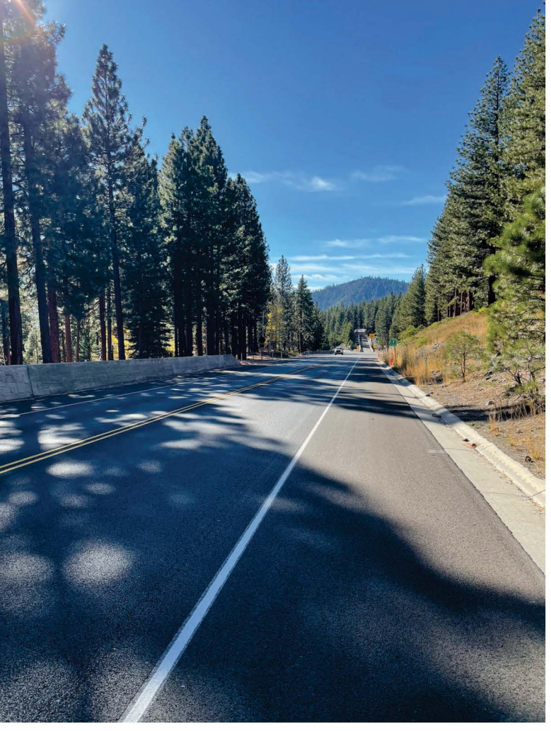
2:48 p.m. Friday, November 3rd (school pick-up is at 2:50 p.m.)

During school hours, cars are not backed up on Mt. Rose Hwy.