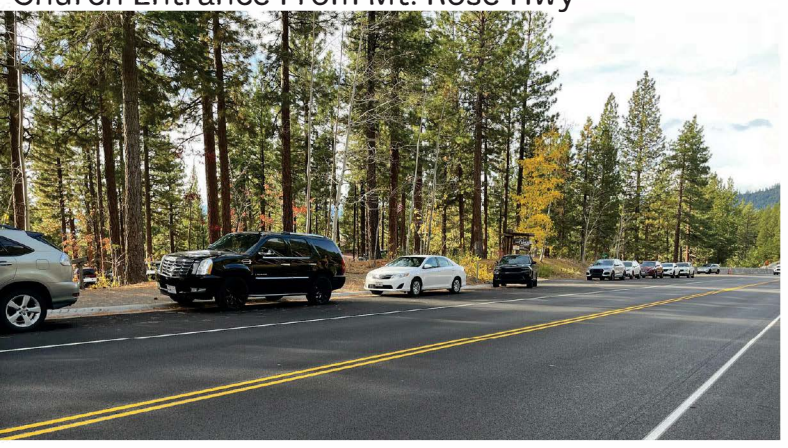
Note: Many mass attendees park on the side of Mt. Rose Hwy even when there is still room in the overflow lot on Kelly Drive as the walk is less strenuous from the highway.