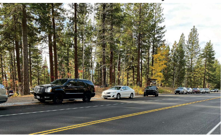
Main "West" Church Parking Lot