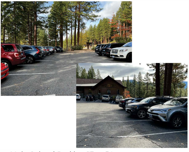
Main School Parking "East" Lot