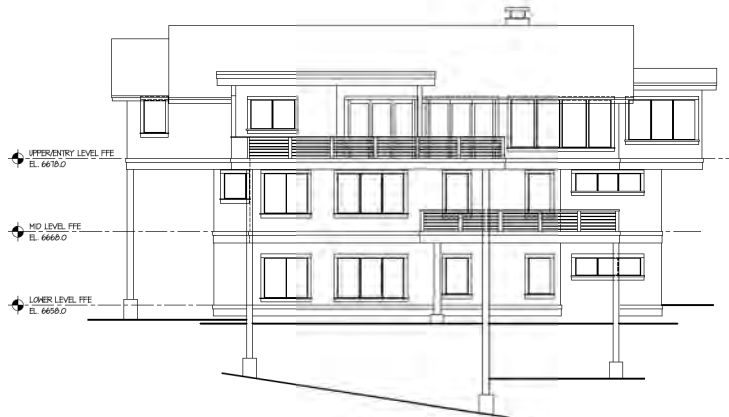
WEST ELEVATION SCALE: 1/4" = 1'-0" (FACING NORTH) (SEE EAST ELEV. FOR FINISHES)