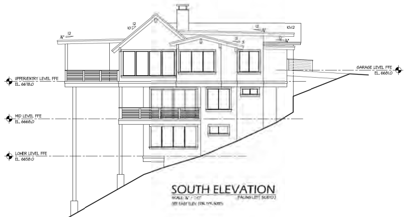
SOUTH ELEVATION SCALE: 1/4" = 1'-0" (FACING SOUTH) (SEE EAST ELEV. FOR FINISHES)