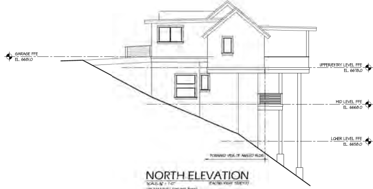
NORTH ELEVATION SCALE: 1/4" = 1'-0" (FACING NORTH) (SEE EAST ELEV. FOR FINISHES)