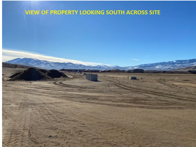
VIEW OF PROPERTY LOOKING SOUTH ACROSS SITE