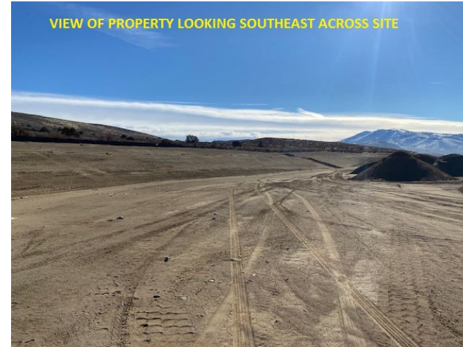
VIEW OF PROPERTY LOOKING SOUTHEAST ACROSS SITE