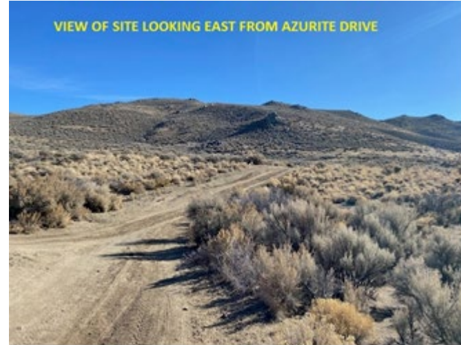
VIEW OF SITE LOOKING EAST FROM AZURITE DRIVE