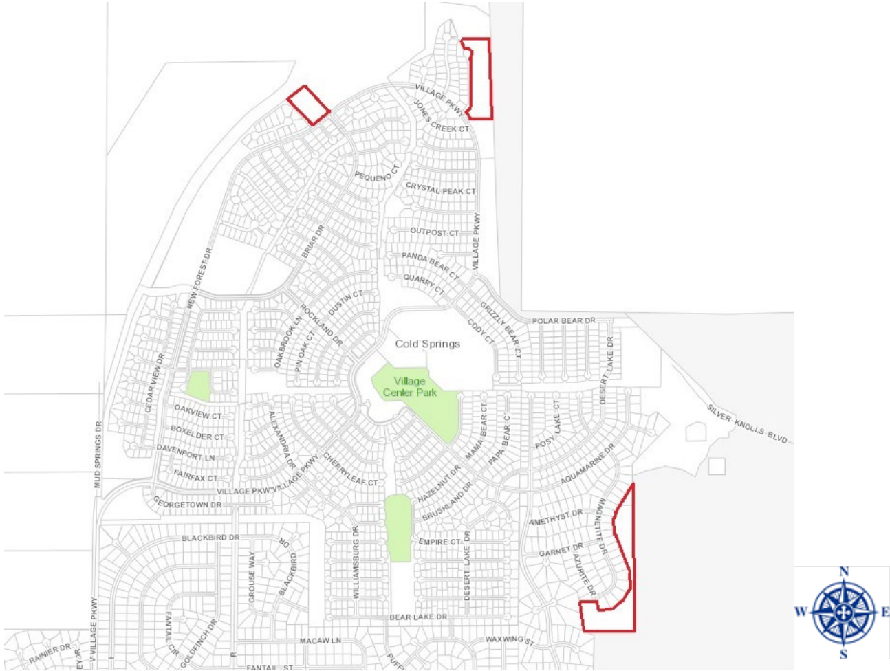
PROJECT AREAS ARE HIGHLIGHTED IN RED.

THREE INDIVIDUAL SITES WITHIN WOODLAND VILLAGE