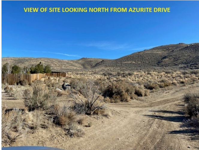
VIEW OF SITE LOOKING NORTH FROM AZURITE DRIVE