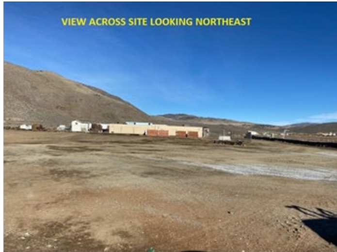
VIEW ACROSS SITE LOOKING NORTHEAST